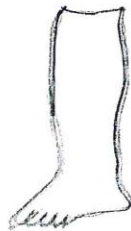
This is my Leg.