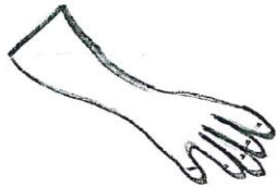
This is my Hand.